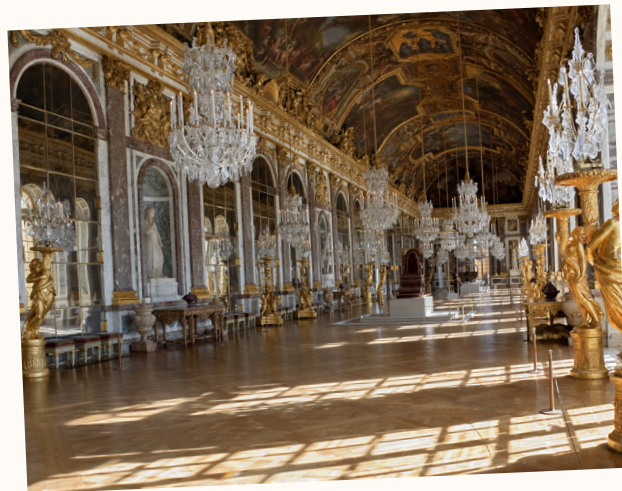
Versailles Tour (1 day) Castle, gardens, Petit Trianon, Grand Trianon

Experience two exclusive get-aways! Relax and discover the beauty of the French countryside at your own pace. Hotel, transportation and entrance tickets are included!