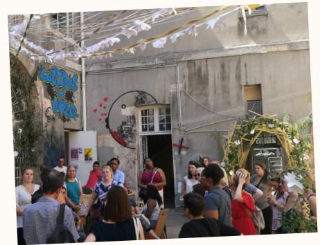
Field visit - Grands Voisins

If you are a faculty member travelling with a group of students, specific application guidelines and rates will apply. We will be happy to have you join us in some program activities and house you at the dorm. Please contact us well in advance, so we can help you prepare for the program with your students and network with French Social Workers too!