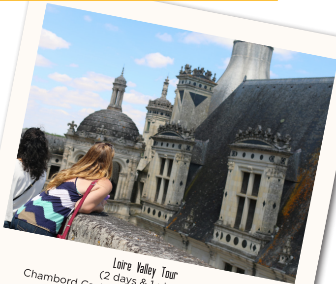
Loire Valley Tour (2 days & 1 night) Chambord Castle, cities of Blois and Amboise, Chenonceau Castle and wine tasting