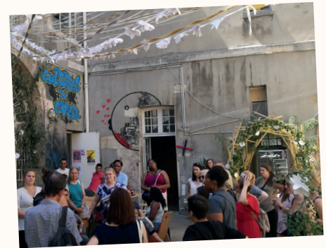
Field visit - Grands Voisins

If you are a faculty member travelling with a group of students, specific application guidelines and rates will apply. We will be happy to have you join us in some program activities and house you at the dorm. Please contact us well in advance, so we can help you prepare for the program with your students and network with French Social Workers too!