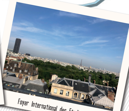
Foyer International des Etudiantes

VENUE - Lectures take place in our gorgeous 19 th century headquarters. Located in the heart of the Montparnasse area, the school is close to the Latin Quarter and breath-taking Luxembourg Gardens. It is surrounded by great cafés, restaurants and shops in one of the safest areas of the capital, day or night.