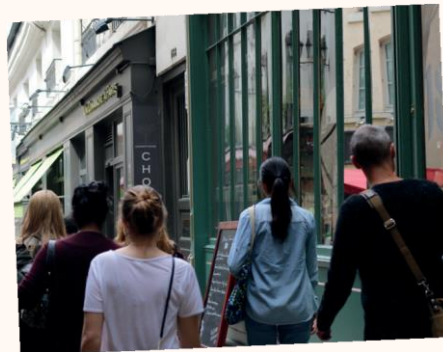
Walking in Paris

If you are a faculty member travelling with a group of students, specific application guidelines and rates will apply. We will be happy to have you join us in some program activities and house you at the dorm. Please contact us well in advance, so we can help you prepare for the program with your students and network with French Social Workers too!